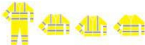
TYPICAL CLASS 3 COVERALL & JACKETS